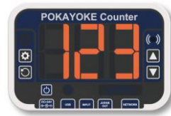
TW-800 Series Pokayoke Receivers