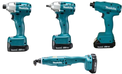
Makita Impact Driver/Impact Wrench/ Cordless Screwdriver

HCP-2402T-MC can be built in by retrofitting to impact driver/impact wrench/cordless screwdriver made by Makita Corporation